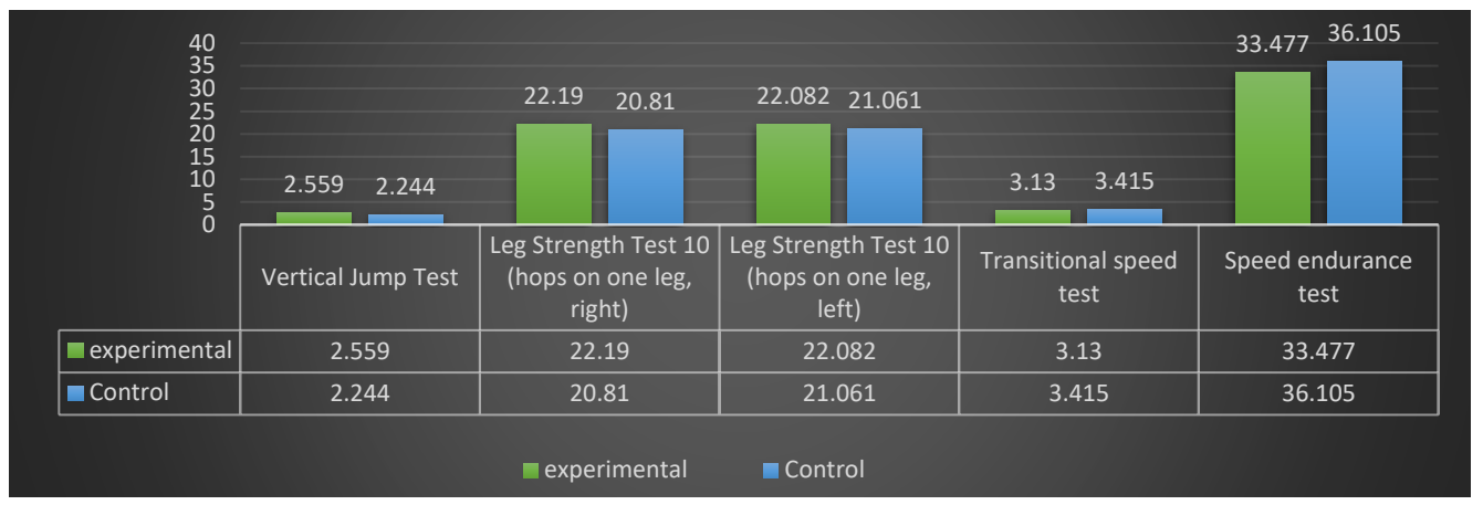
Figure (4-1) illustrates the arithmetic means of the post-tests in the physical ability variables for the experimental and control groups.

It is clear from the results of Table (2) and Figure No. (1) that the (Sig) values of the physical variables of the experimental group are smaller than the significance level, which is 0.05. This indicates the presence of significant differences in favor of the post-test for the experimental group, as the explosive strength of the two men had an arithmetic mean of (2.4030) and a standard deviation of (0.03889) and a significance value of (0.000), which indicates significant differences. In the post-tests in the variable of explosive power and in favor of the experimental group, as for the variable of power characterized by speed for the two men, it had an arithmetic mean of (22.2900) for the right man and a standard deviation of (1.36366) and a significance value of (0.238), as for the power characterized by speed for the left man, it had an arithmetic mean of (22.0820) and a standard deviation of (1.08222).